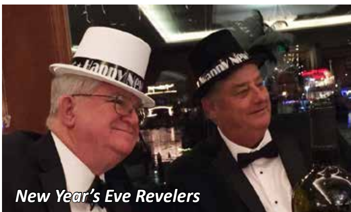
New Year's Eve Revelers

Our monthly meetings are held the first Wednesday of each month at 7 p.m. We welcome your valuable input. Please join our fun group and help us plan the upcoming cruises. We look forward to seeing you all there!