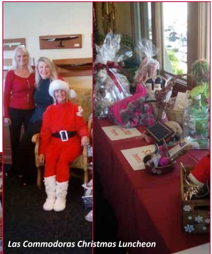
Las Commodoras Christmas Luncheon

It is time to ready our boats, drop our dock lines and exercise our boats in the harbor and the blue waters beyond.