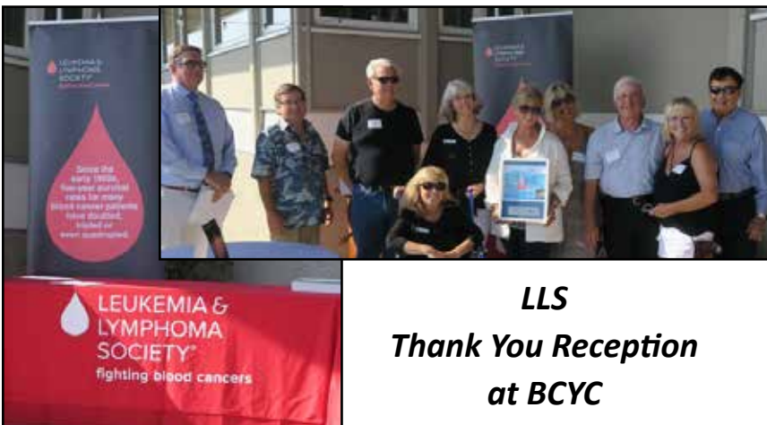
LLS Thank You Reception at BCYC