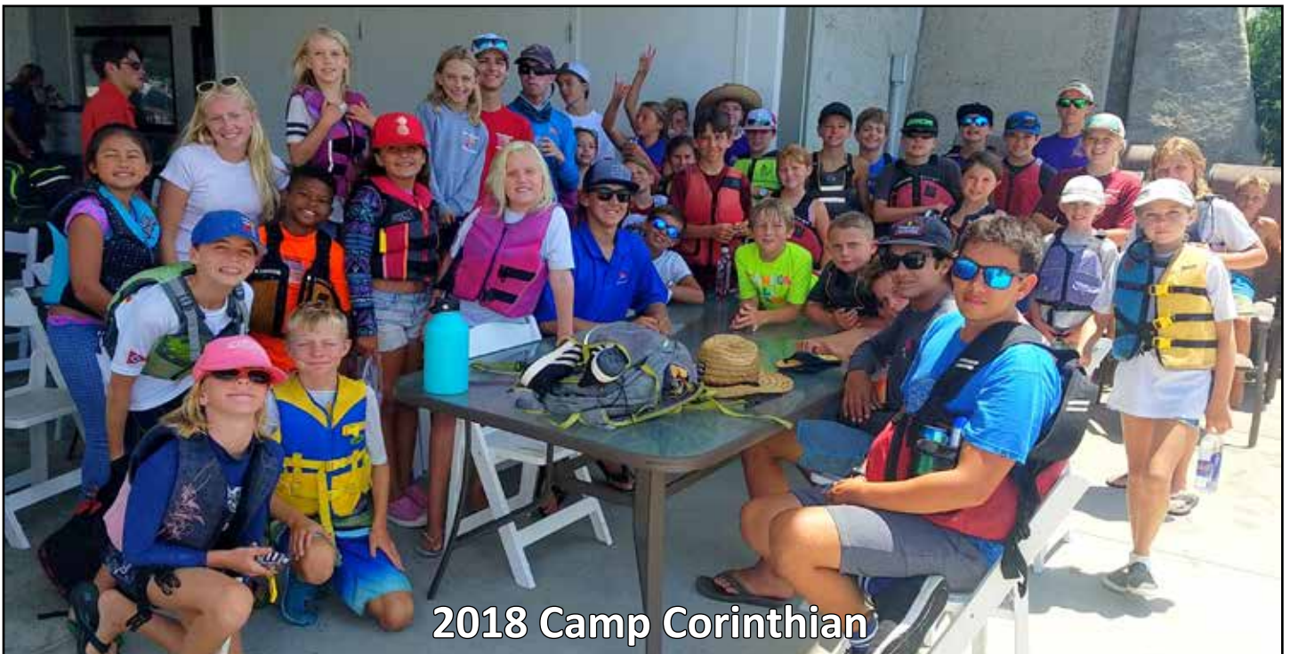
2018 Camp Corinthian